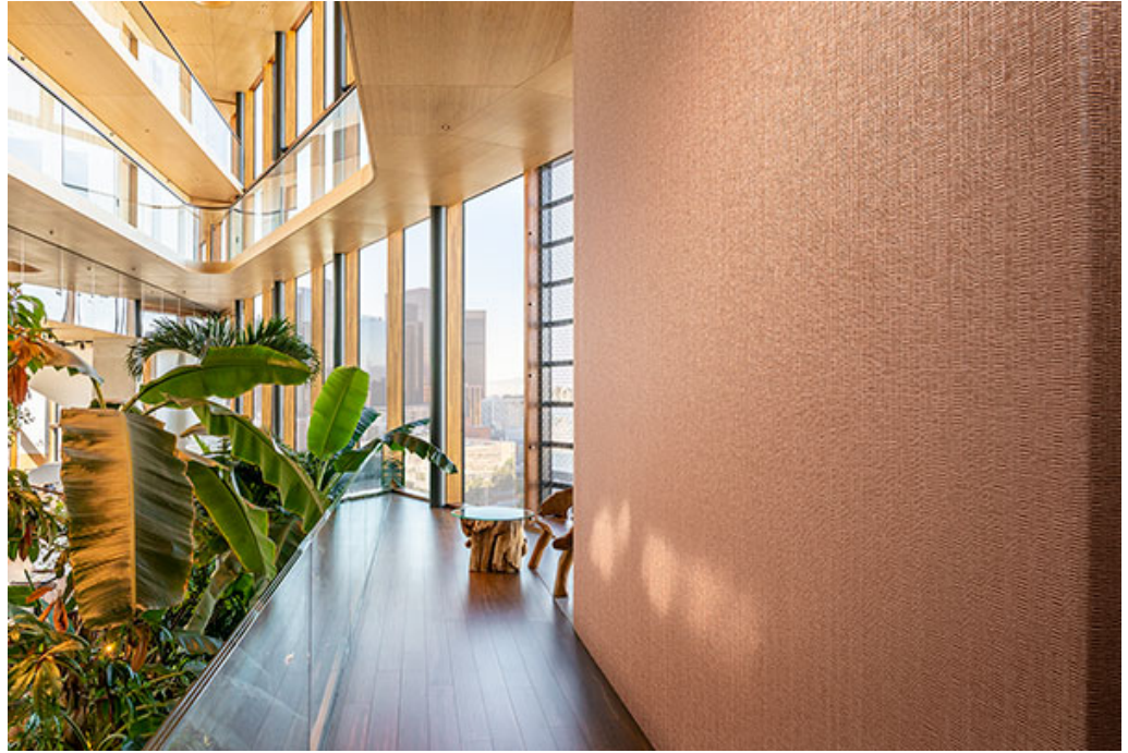
wallcovering – design Barkley

Timeless classic Albert , known for its matte fabric finish, is now available in a fresh new colour range. In creating the colour range Vescom's designers were inspired by appealing warm and neutral tones. The resulting set of 32 colours includes taupe, anthracite, denim blue and natural green, red and yellow.