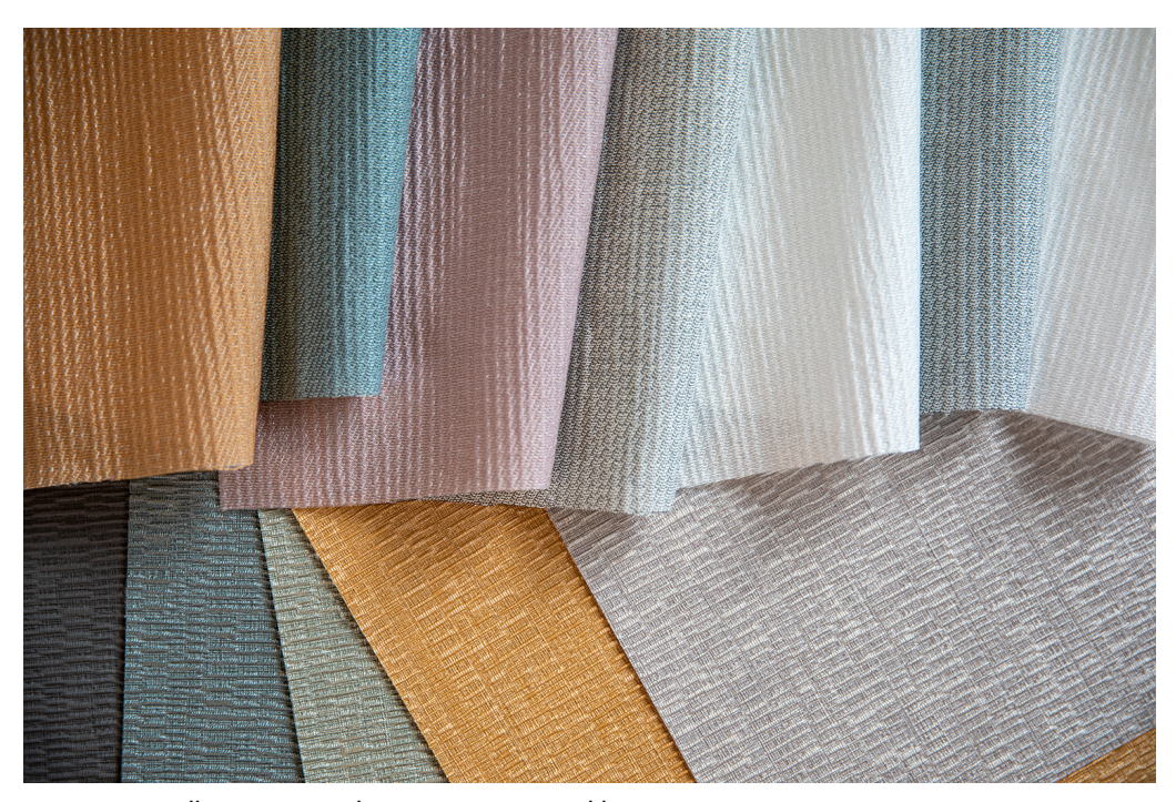
curtain & wallcovering – design Tinos & Barkley

Tinos has a refined textile feel and a matte look. The vertical crêpe effect gives the fabric a natural look. Tinos is ideal for creating privacy in office environments, for example, because the fabric is semi-transparent. Just like Tay, this fabric has a high sound absorption level (alpha<sub>w</sub> 0.6), is supple and can be washed at 70°C. The 16 soft colours, including copper, silver, emerald and lilac, can easily be combined with Barkley design wallcovering.