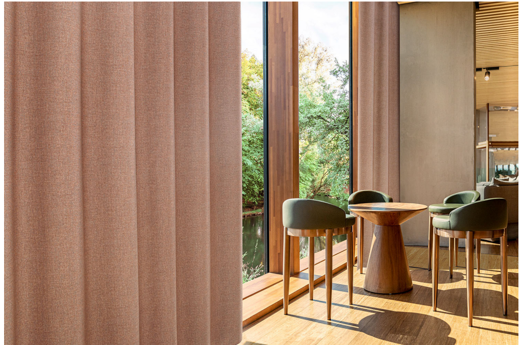
curtain – design Ellis

The benefits of soft furnishings in contract interiors are manifold. Curtains can help to determine the atmosphere and identity of a space, imbuing it with tactility and comfort while regulating light and temperature. They can soften reverberation and the space itself, connect or divide a room. They give us the opportunity to adjust our spaces to support our wellbeing.