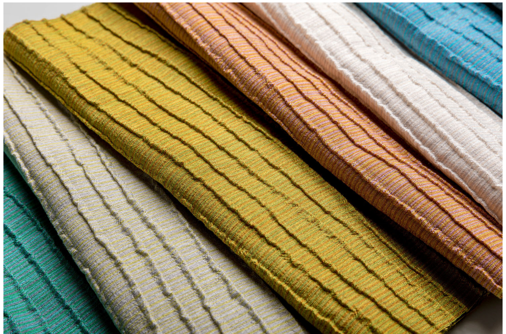
curtain – design Naltar

Naltar and Delos have been updated for today, transformed into more colourful, lively and expressive shades. Through clever combinations of colours and fabric structures, the yarn-dyed melanges – Delos in particular – spring to life in three dimensions.