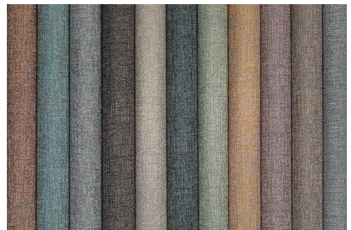
curtain – design Ellis