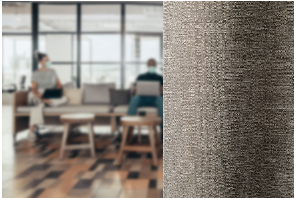
curtain – design Rona

We're not only increasingly aware of hygiene, but of the need to practise safe social distancing. This need has led to a surge of makeshift screen solutions that feel anything but human. Curtains provide a more natural and comfortable alternative to partitioning, and Vescom's Rona and Ellis ranges can be railroaded to achieve a seamless and cost-effective floor-to-ceiling solution. Further contributing to comfort, curtains can regulate the natural light that enters a space and improve its thermal climate. We also know that each space has its own requirements, which is why we can provide the light transmittance, the solar transmittance and the G-value for all five curtain fabrics.