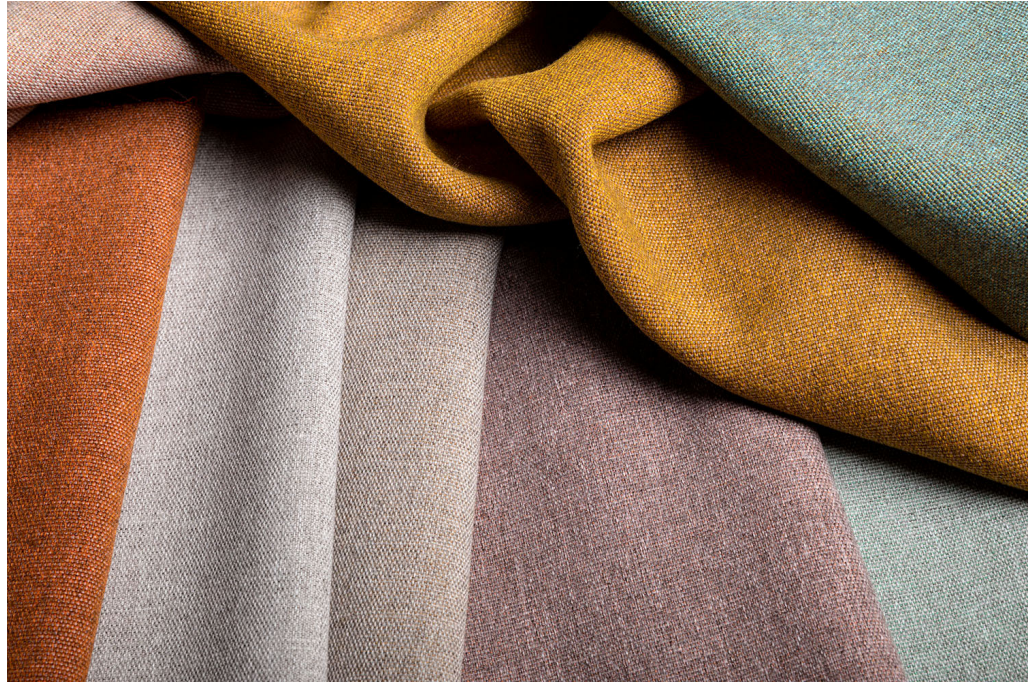
curtain – design Tula

Naltar and Delos have been updated for today, transformed into more colourful, lively and expressive shades. Through clever combinations of colours and fabric structures, the yarn-dyed melanges – Delos in particular – spring to life in three dimensions.