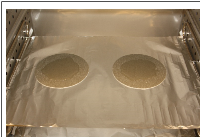
Specimen A medicarine tablets – before the test.