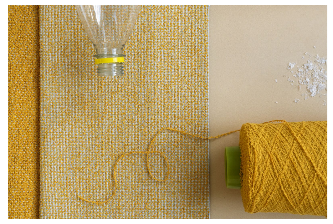
upholstery – Foster & Auckland – recycled boucle yarn

Combining homelike comfort with the highest performance specifications demanded by the contract market, Vescom's sustainable recycled boucle upholstery fabrics inspire physical touch and create a sense of cosy cocooning in commercial spaces. Woven in Vescom's in-house weaving mill and incorporating predominantly recycled polyester FR boucle yarn made from post-consumer PET bottles, yarn-dyed upholstery fabrics Auckland and Foster achieve a three-dimensionality and handcrafted feel that can't be replicated with flat, untextured yarn.