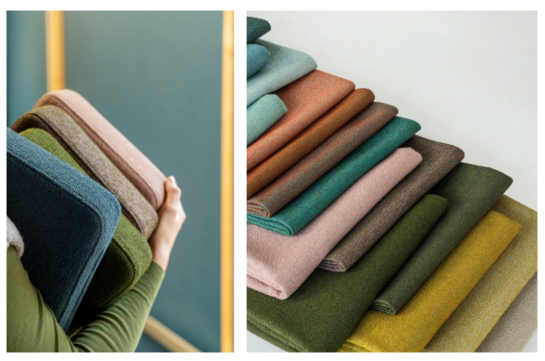
upholstery – Foster & Auckland

Due to their boucle yarn and complementary palettes, Auckland and Foster can be harmoniously combined in interiors and on furniture and wall panels. Their colours work with any kind of atmosphere as well as in combination with other materials.