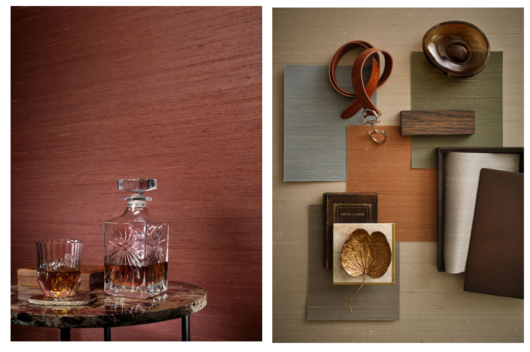
wallcovering – Nirmala

The 10 wallcoverings showcase different facets of silk. With their raw appearance, intentional irregularities and more pronounced slub, Chandra and Madhura celebrate the unexpected beauty found in natural, artisanal materials. Design Ravi accentuates silk's inherent lustre, which creates a soft luminance in interior spaces, while others like Nirmala are more matte. Some underscore their connection to nature through printed motifs – Bodhi depicting the Bodhi tree, a significant symbol of enlightenment in Buddhism; Dipti with irregular lines resembling mountain ranges or layers of the earth's strata; Khilana with blossoms, referencing the Hindi meaning of the name. The patterns are printed using different techniques that produce different looks and feels, from three-dimensionality to metallic effects.