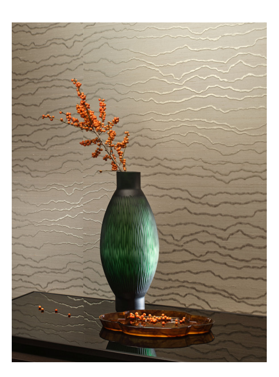
wallcovering – Bodhi