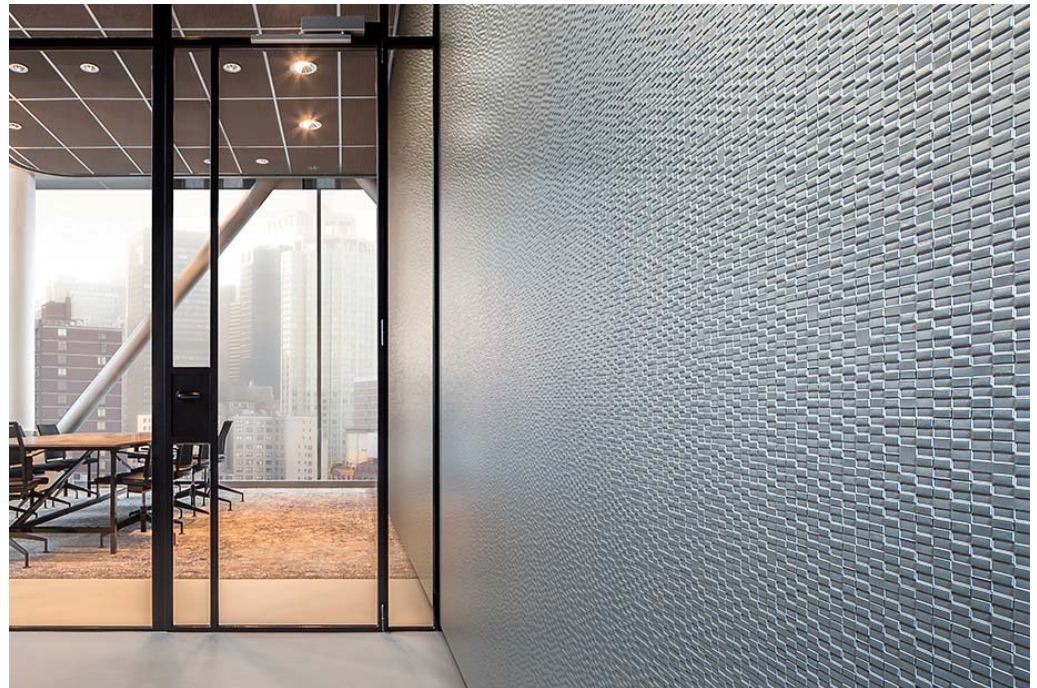
wallcovering – design Clark

True to tradition, Vescom has strong structures in the collection such as Tonga and Shannon. The Clark design is new and really talked about. A robust, architectonic and graphic grid. Clark makes your wall into a true eye-catcher. The heavy texture ensures an impressive 3D effect that ensure that the wall plays with light and shadow in the room. Clark can be supplied in 19 mat and metallic colours.