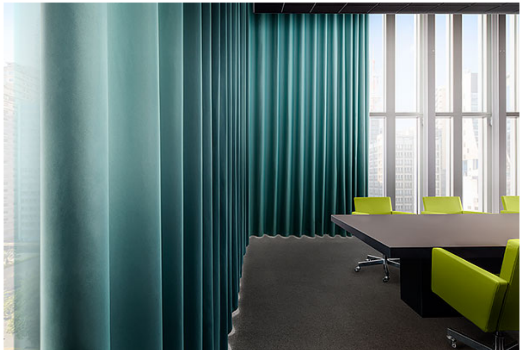
curtain – design Moroni

The full black out curtain fabric, Moroni , has a cotton look and drapes very smoothly. The functional black out feature is a welcome addition to the other dim out curtain fabrics such as Iseo, Bedra and Tavira. Moroni is available in 23 up-to-date, refreshing and bright colours.