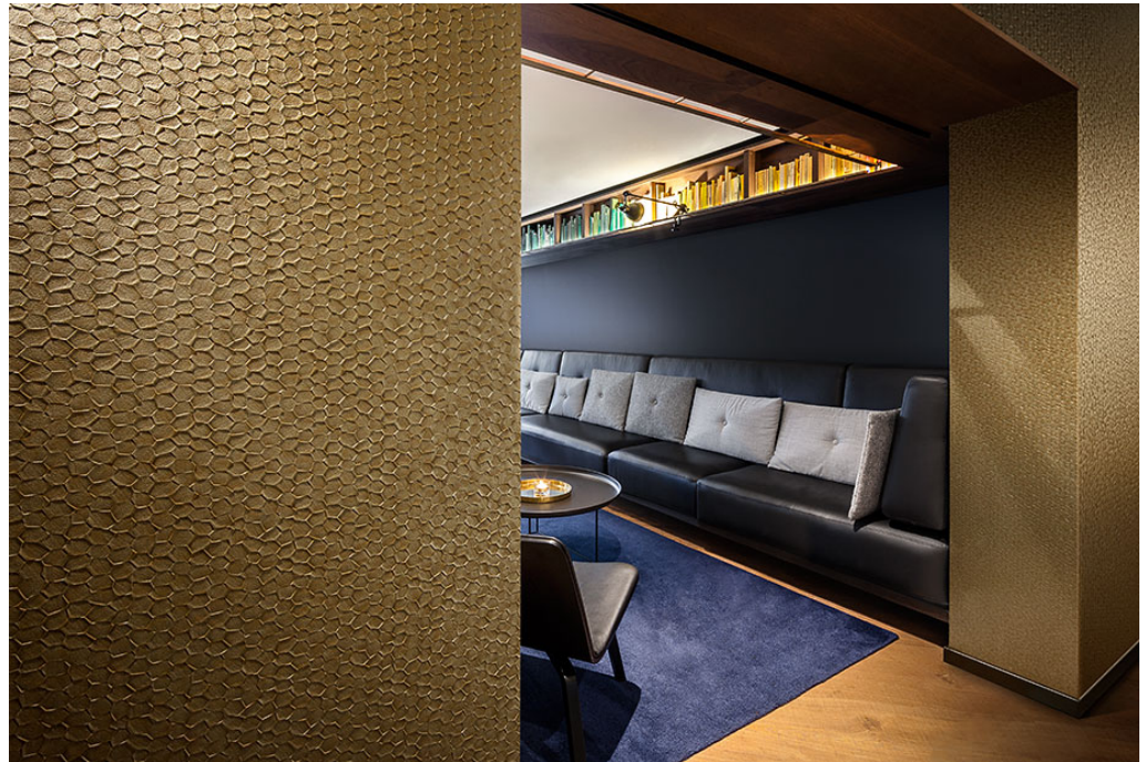
wallcovering – Cantin design

Cantin's rich structure suggests depth and a 3D effect. The distinctive embossing in combination with the 12 metallic colours creates a luxurious look and make the wallcovering come to life even more.