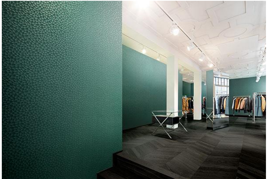
wallcovering – design Aikin

Aikin is a distinct organic design with a large 3D effect. Refined as cut facets, Aikin is playful and unique. The design shows variation in colour including matt and metallic shades. Pastels, white and copper tones, as well as black, emerald green and powder pink provide choice and beauty to any interior.