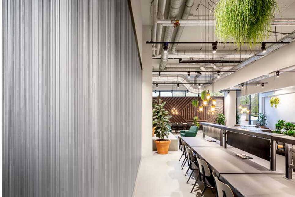
wallcovering – Tonga design

Florence is beautiful in its simplicity and gives every wall an exclusive textile look. With its silk-like appearance, the wallcovering unveils a shiny effect full of richness and layering. The colour palette includes fairytale-like tones: from emerald to blossom to tropical and enchanting greens. The large colour range (30 colours) makes Florence so widely useable that no space needs to be left out.