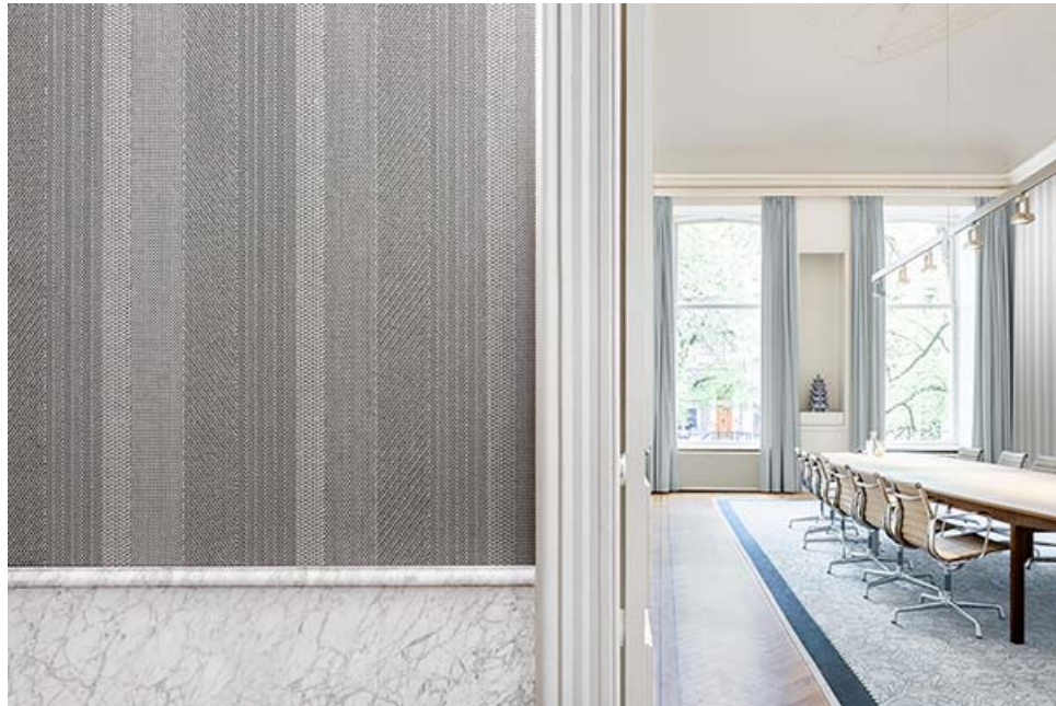
wallcovering – design Switch

Linen and Switch feature a pronounced warp and weft, a trait in line with their textile-inspired origins. Linen finds organic texture through the movement of threads. Marrying tradition and technology, the result achieves a classic look with a modern material. Similarly, Switch is a play on timeless herringbone. Alternating stripes of classical herringbone and basket weaves build a tonal design, whose pattern affords both interesting close-up views and a broad texture when seen from further afar. Like their collection companions, both products are neutral in tone.