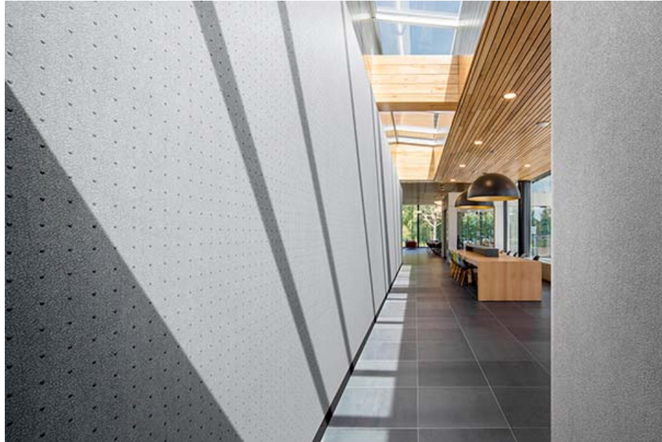
wallcovering – design Kai & Fenda

Unique combinations of techniques and treatments – printing, dyeing, coating, crushing, embossing, flocking, lasering and laminating – result in a rich tapestry of surprising products. The embossed lines of Zagara , for instance, are almost reminiscent of painted Japanese wood. Kai 's complex embossing method is masked by an aesthetically simple design. A grid of three-dimensional dots adds a layer of industrial poetry to ten tones of a handmade-leather look, a material that recurs in the complementary Fenda series.