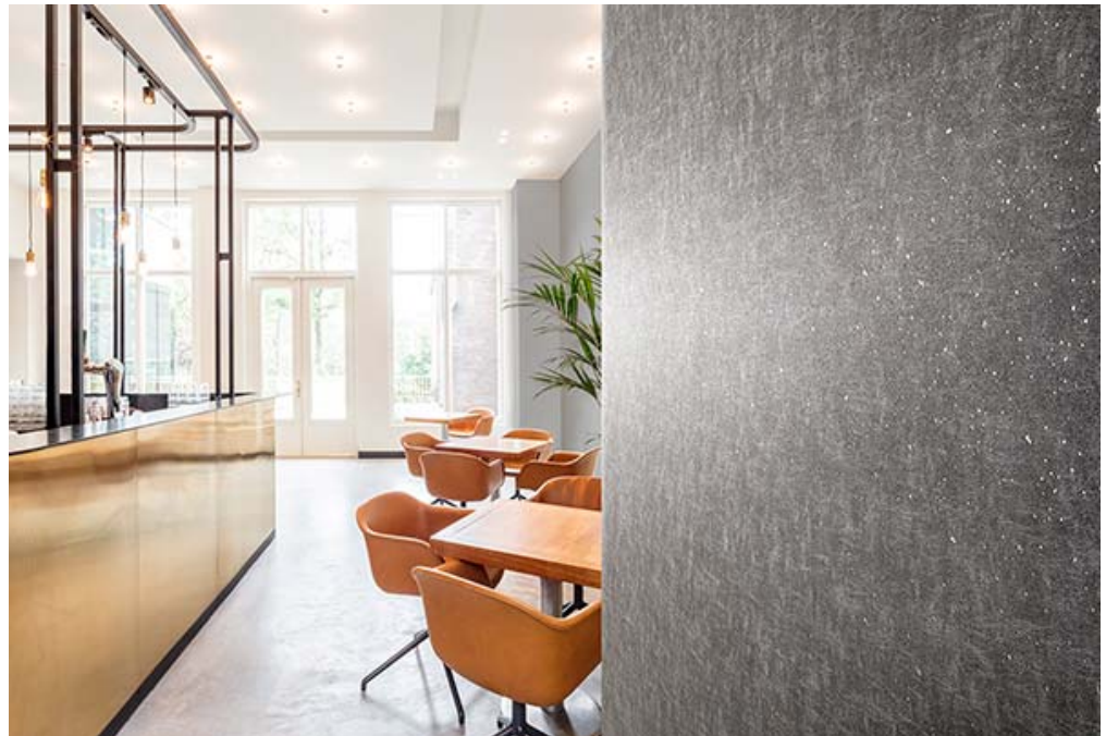
wallcovering – design Montado