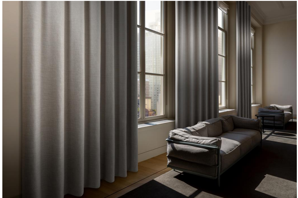
curtain – design Rani

Vescom is further expanding its range of light reducing curtain fabrics to now include three black out and three dim out designs. All with their own look and feel. Flame retardant, railroaded, durable, colour fast and lightfast and most of them can even be washed at 70 degrees. The light reducing curtain fabrics prove that aesthetics and function can be perfectly combined. Even with their high light blocking characteristics, the fabrics have a friendly textile look, are very stylish with full flexibility.