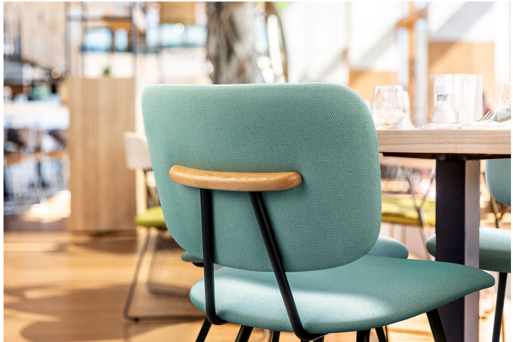
upholstery – design Arrow

Arrow is a newcomer with a young, modern and casual feel. A clear refined textile look. Supplied in 23 fresh, contemporary colours including aqua green, rust and stone.