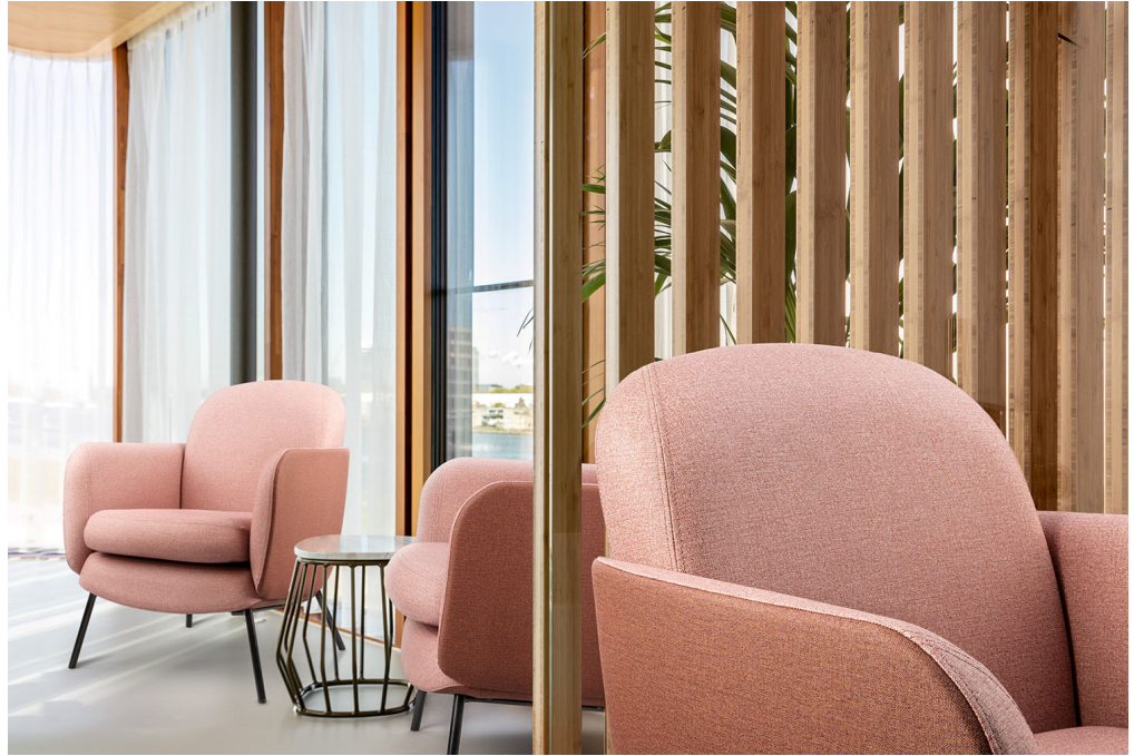
upholstery – design Creek

The well-known leather grain Leone Plus is from a completely new colour series. The 26 full colours both in matt and gloss are beautiful leather colours. Beiges and greens and various grey and earthy hues. Leone Plus is very supple and has a luxurious look.