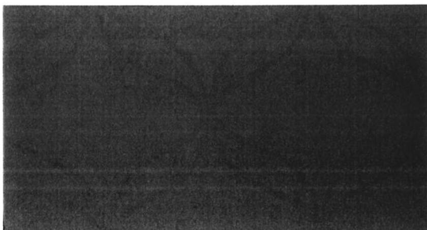
Figure 1: Tested wall covering

More details (e.g. mounting and fixing) are available in the test reports in support of this classification (§2a).